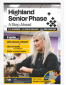
Download our Highland Senior Phase booklet

Highland Senior Phase A Step Ahead Find out more about all our partnership events and courses. How studying at college while you're still at school can help you towards the right job or university.