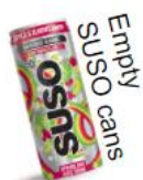
Empty SUSO cans