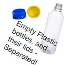
Empty Plastic bottles, and their lids - Separated!