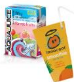
Empty Tetra packs and their straws.