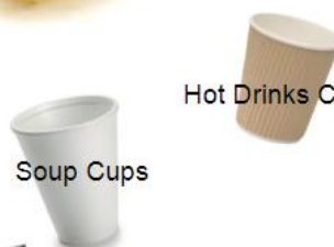
Hot Drinks Cups